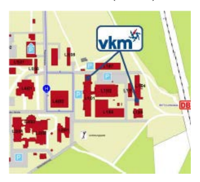
Lichtwiese campus of TU Darmstadt

Please feel free to ask for further information in the institute's administration (room 484).